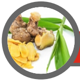
Sunthi: Cold & Cough Reliever