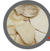
Javakhar: Clears Obstruction in throat

Dosage: For better result, Use with Luke warm water.