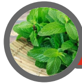
Pudina ka Phool: Allows Relaxed Breathing