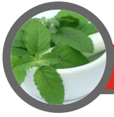
Tulsi: Anti Tussive