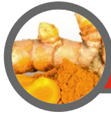
Haldi: Anti Inflammatory