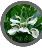
Adulsa: Relieves Cough