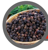
Kali Mirchi: Reduce Chest Congestion