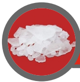
Kapur: Unblocks the Nose