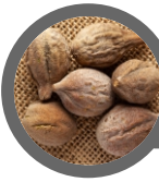
Behada: Releases Mucus