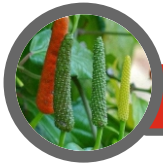
Pippali: Clears Respiratory Track