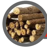
Yashtimadhu: Sore Throat Reliever